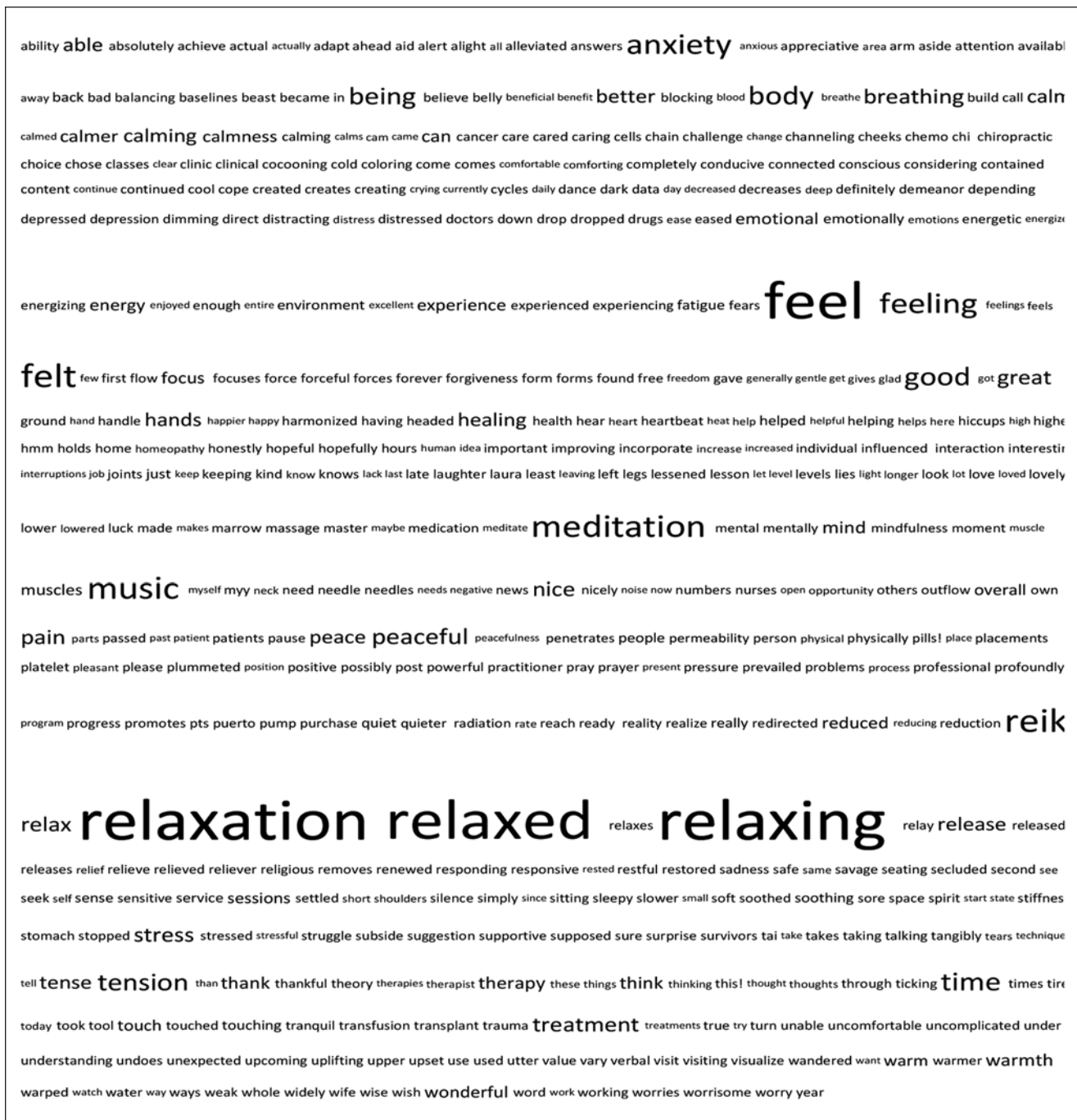
Figure 2. Word cloud: Patient experience of Reiki.

caregivers, staff) physically, emotionally, and spiritually. In this article, we analyzed data collected as part of an evaluation of a Reiki volunteer program in a large, urban academic cancer center. We found that even by a conservative estimate, 82.6% of individuals who received Reiki had positive experiences. Reiki produced clinically meaningful and statistically significant short-term reductions in distress, anxiety, depression, pain, and fatigue. Qualitative data suggests that Reiki evoked a relaxation response for many